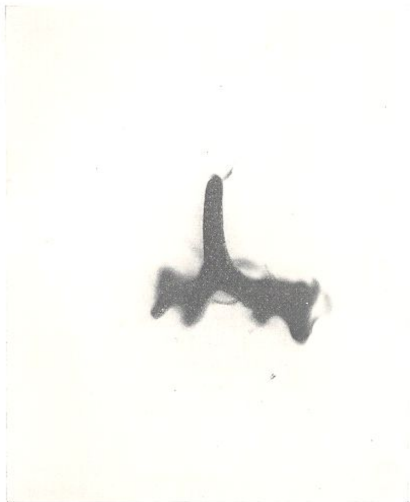
Mesosome of specimen of A. pseudopunctipennis from California, showing serrate leaflets.